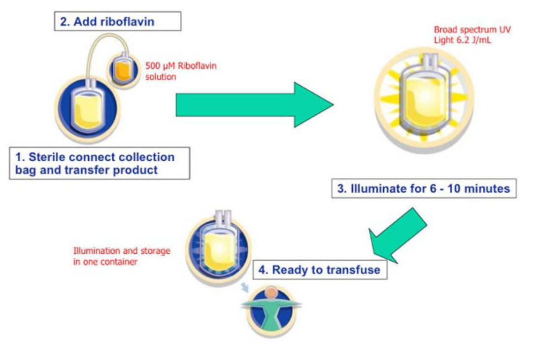
Figure 1: Riboflavin and UV light pathogen reduction process. Riboflavin was dissolved in 0.9% saline at a nominal concentration of 500 \mu M. The solution was sterile connected and drained into each platelet product. Bacteria was added aseptically to each platelet unit and then treated with 6.2 J/ml of UV energy (approximately 6–10 min). In this in vitro study the post-treatment platelet unit was sampled to determine the final bacterial titer.