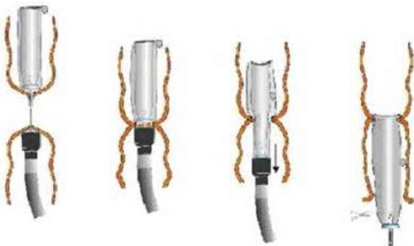
Figure 3: After inserting the stapler-head together with the attached C-seal in the proximal bowel and the stapler in the rectal stump, the stapler is fired and gently pulled through the anus together with the C-seal.