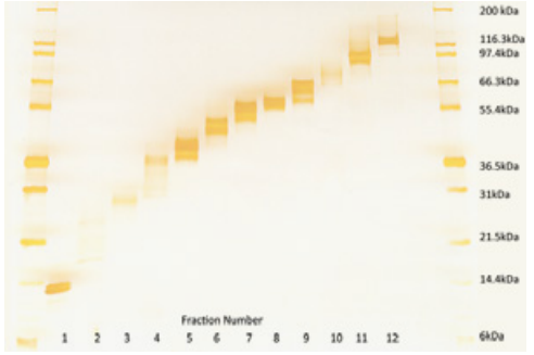
Figure 1. Proteins from bovine liver homogenate separated using the GELFREE Fractionation system. 6 \mu L of each 150 \mu L fraction was loaded and run on a 1D SDS PAGE gel and silver stained. A molecular weight (MW) standard was also loaded as indicated. Please click here to see a larger version of figure 1.

A 200 µg of bovine liver homogenate was partitioned into 12 fractions each, using the GELFREE Fractionation System. 6 µL of each fraction was run on a standard 1D SDS PAGE gel and silver stained. As shown in Figure 1, the protein sample was fractionated into 12 distinct fractions, spanning the molecular weight range from 3.5kDa to 150kDa. A molecular weight standard (ColorBurst, Sigma) are also shown in lanes 1 and 14. The gel shown here highlights the high-recovery rate achieved using the GELFREE 8100 system for protein fractionation. The gel shown here represents 4% of the protein recovered from 200 µg.