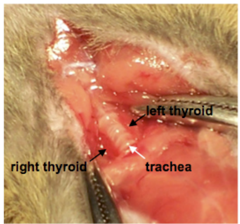
Figure 1. Exposing the thyroid. Labels indicate the right and left thyroid glands flanking the trachea.

Due to the small size of the thyroid and use of injectable delivery, unintentional outcomes may arise. Figure 3A illustrates the most commonly observed, which is development of a tumor mass outside of, but not encompassing, the thyroid. This is more than likely due to needle penetration through and beyond the thyroid when cells are expelled. Occasionally, mice presenting with no tumor growth, both grossly and histologically, are detected as shown in Figure 3B . Absence of detectable tumor development can be caused by expulsion of the cell suspension from the injection site and dissemination into neighboring tissues and cavities.