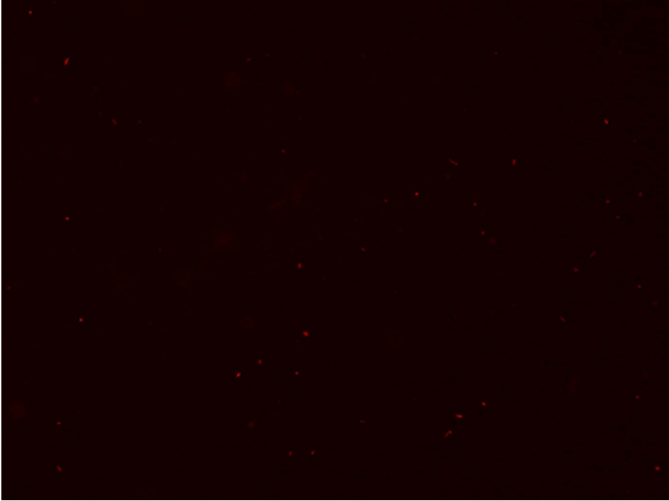
Figure 2. PI staining of M. leprae suspension. Red fluorescence showing the small number of dead M. leprae. 400X.

Second, an inoculum with high viability will impact on the multiplication of bacilli in the footpads of animals after 4-5 months post inoculation, with development of obvious macroscopic lesion, as shown in the video (Protocol 1). The third way to assess the success of the protocol is by evaluating the survival and multiplication of AFB in mouse footpads inoculated with bacilli that had been frozen for different periods (See Protocol 4).