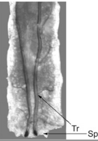
Figure 1. Dorsal view of an intact 3<sup>rd</sup> instar larva. The movement of trachea due to pulling of the attachments from heart is used to observe the heart rate.