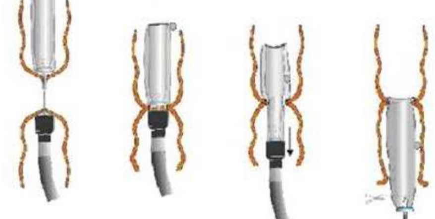
Figure 3: After inserting the stapler-head together with the attached C-seal in the proximal bowel and the stapler in the rectal stump, the stapler is fired and gently pulled through the anus together with the C-seal.